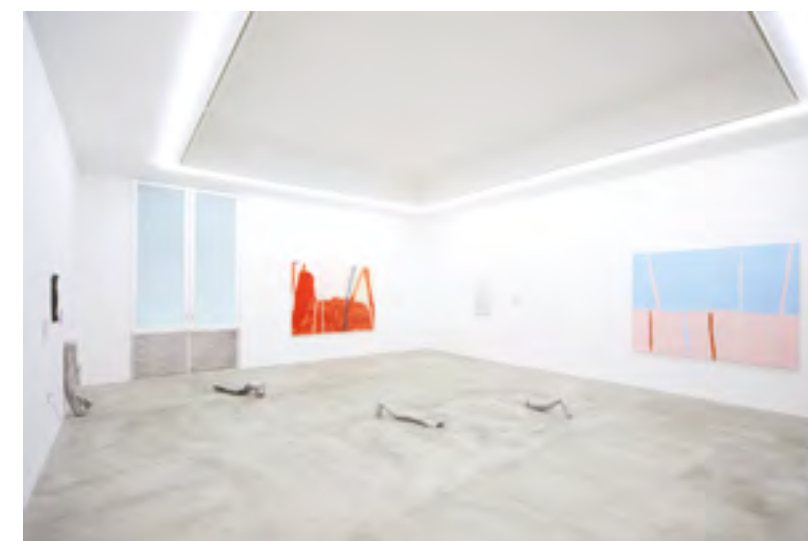
Neil Beloufa Installation view at Pejman Foundation, Tehran (2017)