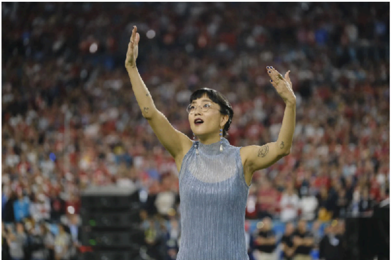
Christine Sun Kim performing the national anthem in American Sign Language at the Super Bowl on Sunday.