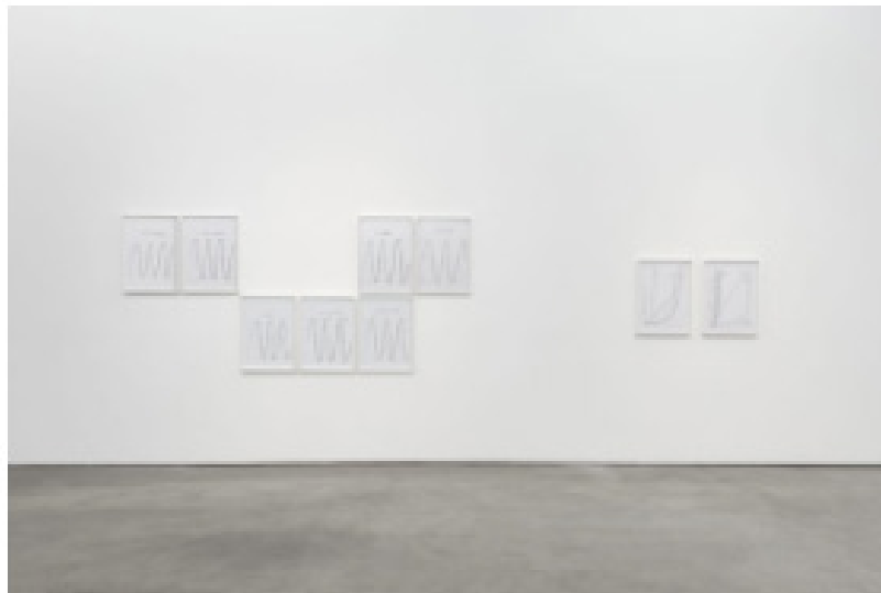
Christine Sun Kim, Trauma (2020). Courtesy of the Artist and François Ghebaly, Los Angeles.

Kim's list of traumas, compacted by the events of this year, is long, complex, and intersectional. "When we see hearing people oppress us, that's a behavior we learn and we then oppress ourselves," she said. "On top of that, the Deaf community is always struggling with access to resources, to education. Then you have lifelong consequences that impact Deaf people's health, education, and employment."