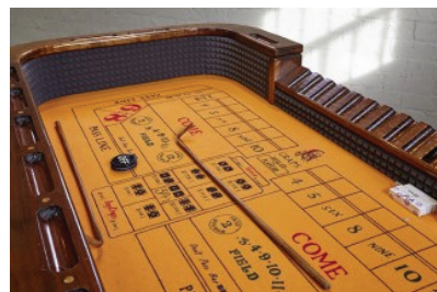
4 JPW3, ZZ Craps , 2014.