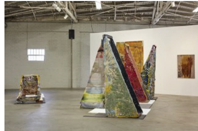
2 View of JPW3's "32 Leaves, I Don't The Face of Smoke," Night Gallery, Los Angeles, 2014.