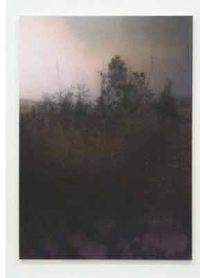
7 Sayre Gomez, Untitled Painting, II , 2014.