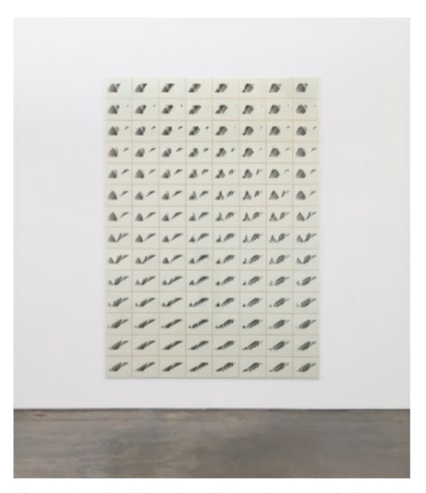
Channa Horwitz, "Variation and Inversion on a Rhythm IV" (1976), black ink on green graph paper, 112 elements, each: 8.5 x 10.75 inches

LOS ANGELES — It is a mistake to think of Channa Horwitz as an abstract artist, even if she thought so herself. She was a realist, working concretely with the numbers one to eight and a small set of rules. Just as DNA uses only four nucleotides in varying patterns to encode 20 amino acids that make millions of proteins, Horwitz's narrow parameters generated endless arrangements of daunting complexity.