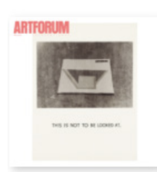
PRINT APRIL 2020