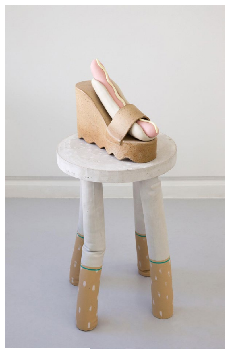
"Dog in Heels," 2017. Mrs. Gallery