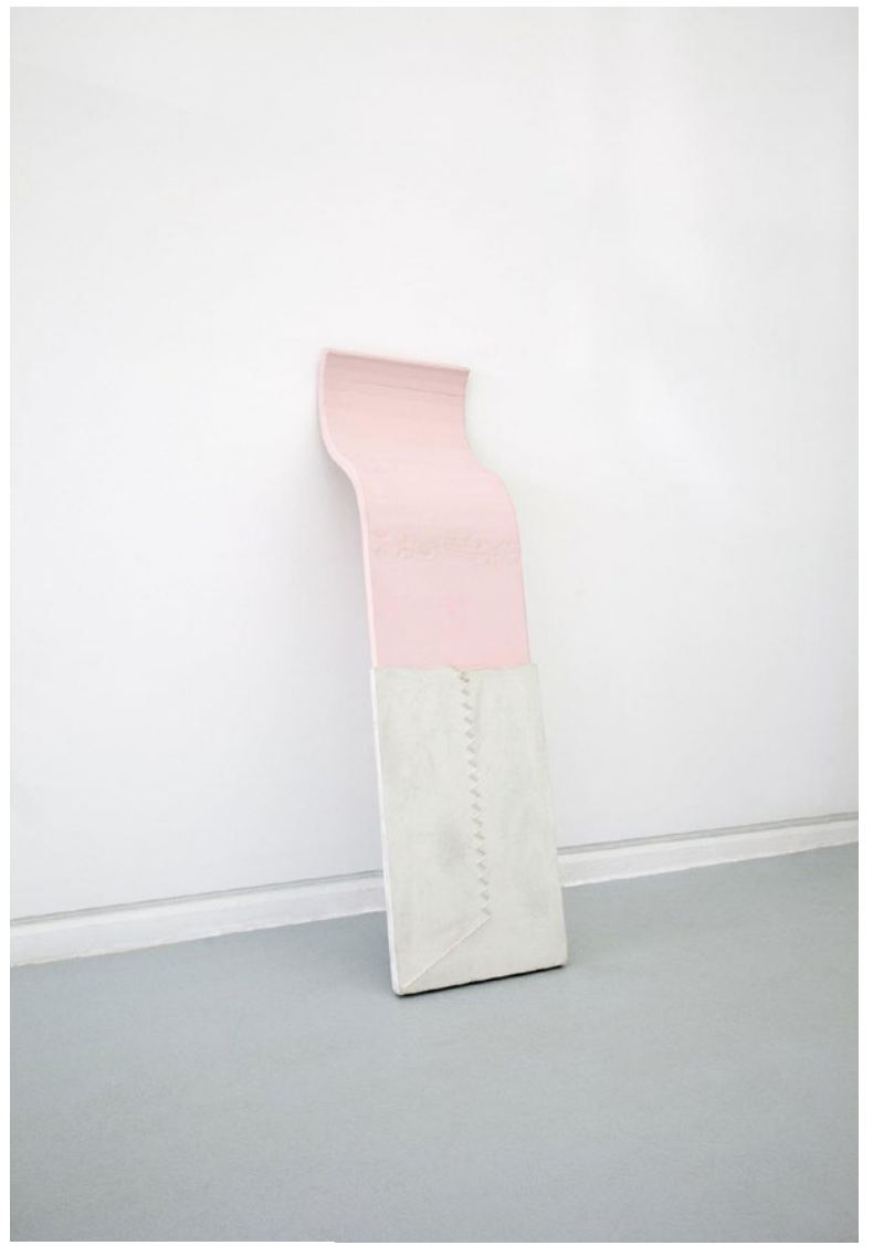
"Big Yummy," 2017. Mrs. Gallery

Ms. Belanger's sculptures, made with stoneware, porcelain and concrete, allude to recognizable objects and yet blur their references. "Cheap Cookie" (all works are from 2017) is an Oreo grasped between two human fingers, rounded into a nearly abstract circle. "Dog in Heels" is a hot dog eased into a sandal and "Big Yummy" looks like a minimalist concrete slab, but actually represents a piece of chewing gum wrapped in foil paper.