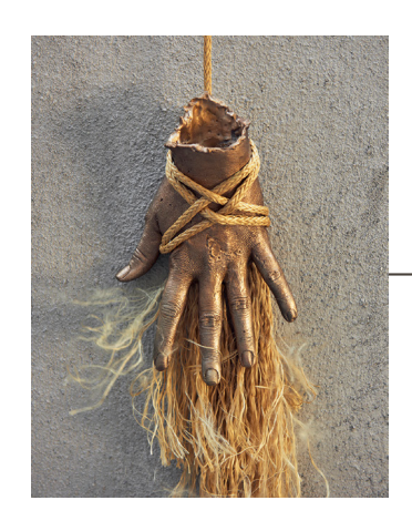
Kelly Akashi, 'Feel Me' (2017). Detail.