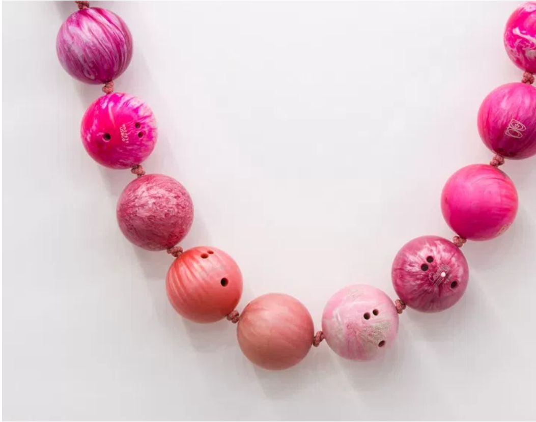
Kathleen Ryan, Pearls (2017). Bowling balls, rope, dimensions variable.