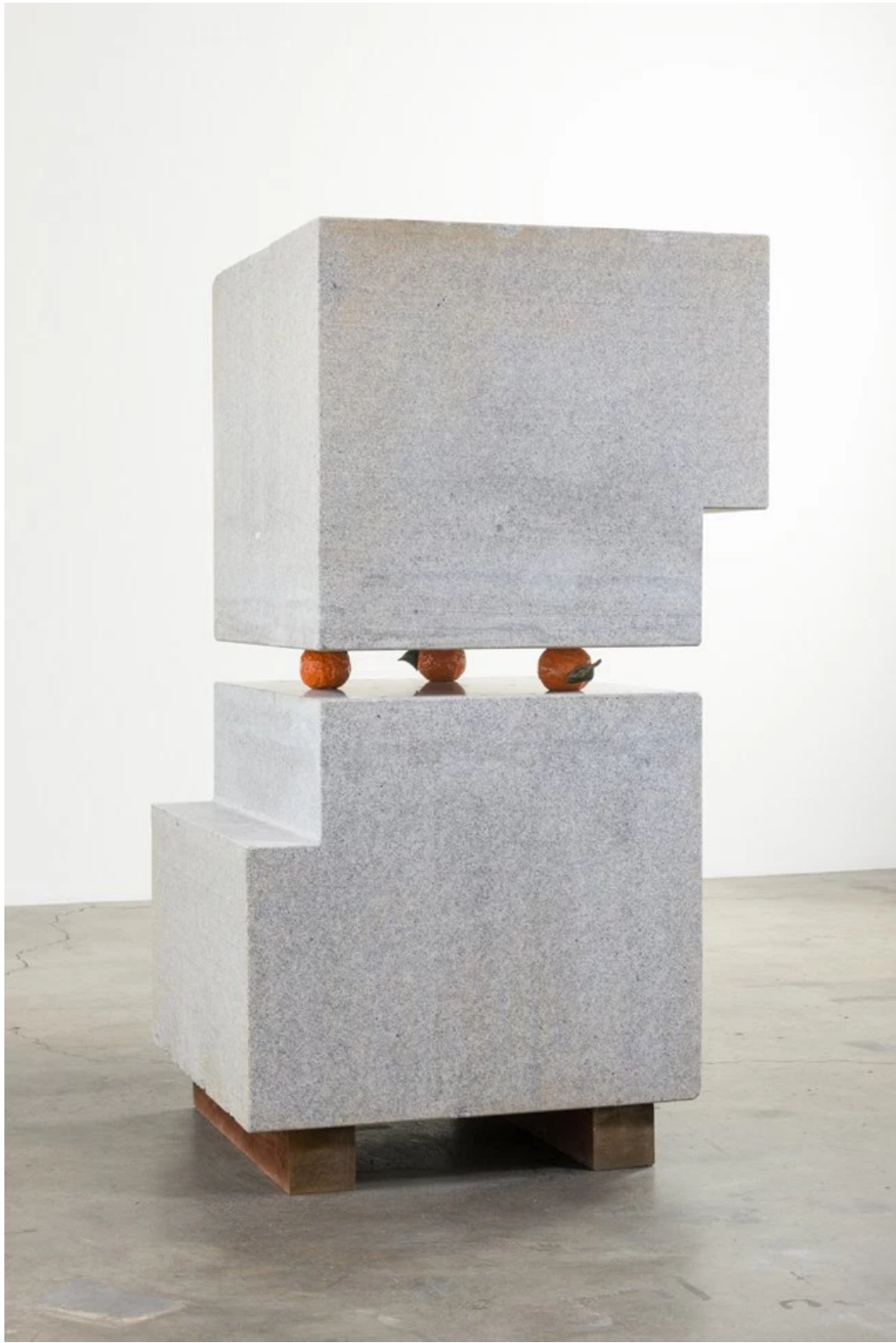
Kathleen Ryan, Between Two Bodies (2017). Granite, glazed ceramic, steel, 82.5 x 41.5 x 47.5 inches.