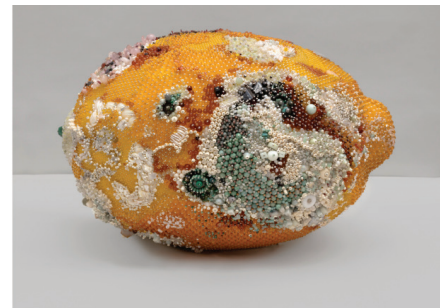
"Bad Lemon (Creep)" (2019), amazonite, aventurine, black onyx, Italian onyx, turquoise, labradorite, carnelian, sodalite, jasper, sesame jasper, serpentine, fluorite, Ching Hai jade, snow quartz, magnesite, agate, brecciated jasper, rhodonite, rhodochrosite, red agate, garnet, tree agate, rose quartz, amethyst, lilac stone, limestone, marble, mother of pearl, bone, freshwater pearl, glass, steel pins on coated polystyrene, 20 x 20 x 28 1/2 in.