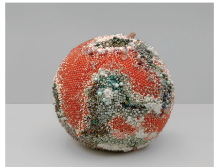
"Serpentine Flurry" (2019), serpentine, onyx, quartz, rose quartz, rhodonite, jasper, unakite, smoky quartz, amazonite, sesame jasper, olive jade, fluorite, lodolite, amethyst, tree agate, Ching Hai jade, lapis lazuli, agate, Russian serpentine, marble, ruby in zoisite, abalone shell, bone, coral, freshwater pearl, petrified wood, glass, steel pins on coated polystyrene, 23 x 25 x 25 in.

Staugaitis, Laura, "Moldy Fruit Sculptures Formed From Precious Gemstones Challenge Perceptions of Decoration and Decay," Colossal, October 16, 2019.