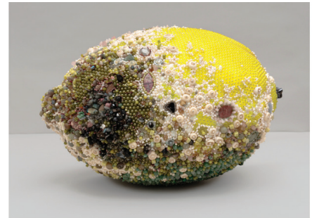
"Bad Lemon (Sour Sparkle)" (2019), serpentine, aventurine, labradorite, rhodonite, rhodochrosite, pink aventurine, rose quartz, black onyx, citrine, unakite, tektite, smoky quartz, quartz, carnelian, limestone, pink lepidolite, tree agate, red agate, grey agate, black agate, brecciated jasper, hematite, mother of pearl, bone, freshwater pearl, 19 3/4 x 20 x 29 in.