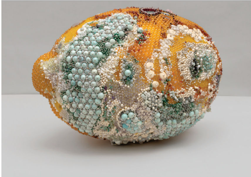
"Bad Lemon (Creep)" (2019).

Artist Kathleen Ryan creates a conversation between the beautiful and the grotesque in her oversized sculptures of mold-covered fruit. The New York-based artist uses precious and semi-precious stones like malachite, opal, and smoky quartz to form the simulacrum of common green rot on each fruit. Working at a larger-than-life scale, Ryan creates a foam base, rudimentarily painted to map out the fresh and rotten areas on the surface. She then individually places each gemstone, with varied shapes, sizes, and colors that emulate the shift from desirable to disgusting. Lemons are a particular favorite, but Ryan also works with oranges and pears, with each work scaling 6 to 29 inches. "The sculptures are beautiful and pleasurable, but there's an ugliness and unease that comes with them," Ryan told The New York Times.