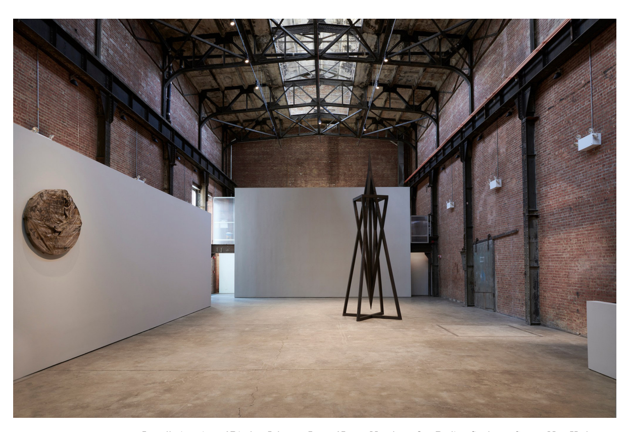
Installation view of Rindon Johnson: Law of Large Numbers: Our Bodies, SculptureCenter, New York, 2021

light," and notes how the browns of a skyscraper photograph "preserve their natural obscurity in almost any light!" Reminiscent of a Frank Stella star, the sculpture feels fitting inside the space's ceiling of many X's and industrial bolts; on a floor whose grid is interrupted by cracks shaped not unlike the streams of water.