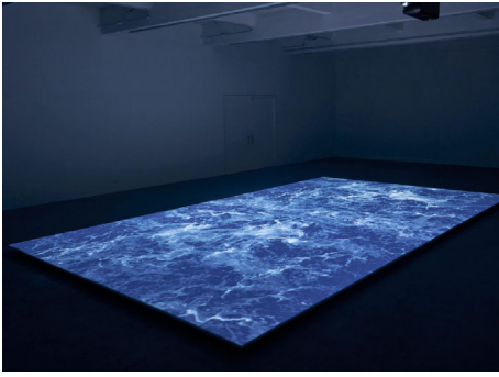
Rindon Johnson, 'Coeval Proposition #2: Last Year's Atlantic, or You look really good, you look like you pretended like nothing ever happened, or a Weakening (2021). Installation view Chisenhale Gallery', 2021. Commissioned and produced by Chisenhale Gallery, London and SculptureCenter, New York, 2021. Courtesy the artist. Photography: Andy Keate