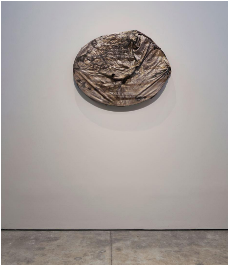
Rindon Johnson: 'Law of Large Numbers: Our Bodies', installation view, SculptureCenter, New York, 2021.