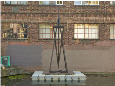
Rindon Johnson, 'Coeval Proposition #1: Tear down so as to make flat with the Ground or The *Trans America Building DISMANTLE EVERY-THING' (2021). Installation view Hertford Union Canal, 2021. Commissioned and produced by Chisenhale Gallery, London and SculptureCenter, New York, 2021. Courtesy the artist. Photography: Andy Keate

In the large-scale sculpture, Coeval Proposition #1: Tear down so as to make flat with the Ground or The *Trans America Building DISMANTLE EVERY-THING , Johnson references the Transamerica Pyramid in San Francisco, an iconic landmark of the city's skyline. The building's concrete, steel, and glass with a facade covered in crushed white quartz has been reimagined in re-claimed redwood and ebonised, or darkened. As Johnson writes, this process allowed him to 'more readily see myself reflected in the building which by name and location reflects my trans identity back to me (we share a name) – my skin is brown, almost nearly Black in certain light.'