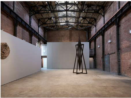
Rindon Johnson: 'Law of Large Numbers: Our Bodies', installation view, SculptureCenter, New York, 2021.