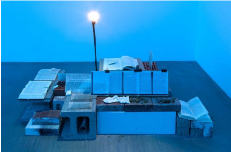
Installation view, 'A Hard White Body, a Soft White Worm', Portikus, Frankfurt, 2018.

But I am still interested in scent and am creating a demonic smell for my project at the upcoming Prospect New Orleans triennial. This idea is based on medieval European theories that disease was caused by a demonic smell rising up from hell and could be fought by covering the body with another demonic smell. At Prospect.5, I will be creating ceramic sculptures of swamp creatures made from the clay dug near Saint Malo, Louisiana, thought to be the first Asian-American settlement in the US started by Filipino indentured laborers or slaves conscripted during the Spanish Manila galleon trade who jumped ship in Louisiana en route to South American colonies. They were joined by Chinese indentured coolie laborers and fugitive slaves.