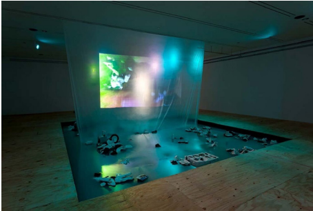
'A Hard White Body, A Porous Slip', 2018, Reva and David Logan Center for the Arts, Chicago.

Japanese katazome prints also show influences from other cultures. A book from the nineteenth century describes a textile design with Roman letter-forms that come from Portuguese and Dutch trade monograms that are used as a design element. Another monogram shows a design with an asemic use of recognizable letters that are reversed or upside down and used as a graphic element. The author of that book, in the casual racism of the nineteenth century says, “any Jap wearing these clothes must think he is a superior being since he is covered in symbols that no one, not even himself, can read.” It’s a historical example kind of like when people nowadays get tattoos of Chinese or Japanese characters that they later find out mean “dog” or “noodles” or are just completely nonsensical. The designs I chose to recreate or change and adapt into my indigo textiles reference specific historical patterns where these moments of intercultural symbolism emerge.