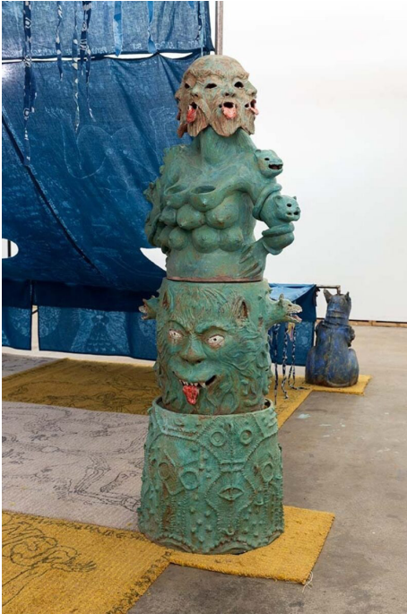
'Sleeping, Rotting, Resting, Weeping', 2021, hand-printed (katazome) and hand-drawn (tsut-sugaki) indigo panels, steel bar, dyed rugs, glazed ceramics, epoxy resin, feathers, block-printed and digitally printed fabric (masks), bells, tassels, and miscellaneous small objects, dimensions variable.