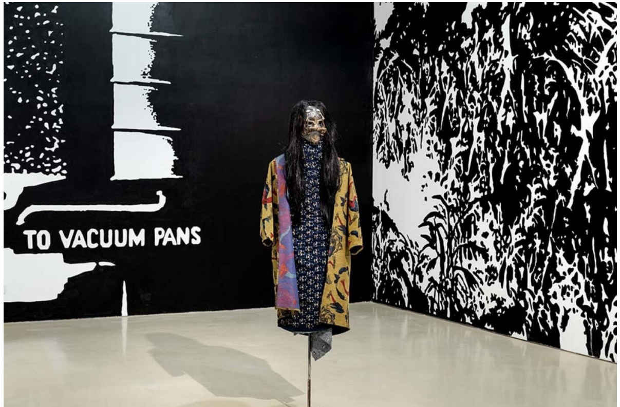
Installation view, Pigs and Poison, 2021, Guangdong Times Museum, Guangzhou.

apocalyptic California landscape, this barren desert, and there's an earthquake, and a version of the indigo temple emerges from beneath the earth, and this cat demon is in the temple doing qigong and stretching.