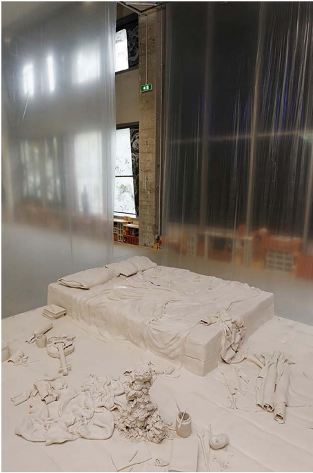
Installation view, A Hard White Body, a Porous Slip , Bétonsalon, Paris, 2017.

In thinking about tactile materials, I was also thinking about scent in relationship to touch and how both these senses during the pandemic became loaded with a contaminating force, the idea that you could breathe in the virus. In fact, all my work is preoccupied with the body’s porosity to another body, to one’s environment, to other species that live inside or alongside us. I had begun researching medieval theories around disease and miasma back in 2018 for Pigs and Poison before COVID, although it was informed by epidemics like SARS. I was also looking at outbreaks of plague in the early twentieth century that were blamed on Chinese and other Asian citizens whose right to live and work in the US was being contested around the same time with laws like the Page Act of 1875 and the 1882 Chinese Exclusion Act. I had originally proposed to have an herbal tincture based on medieval plague remedies that would be vaporized from inside the ceramic pillars. That’s why a lot of the ceramic figures have holes in their mouths and eyes, to let the mist out. But in light of COVID, it felt a bit on the nose, and I’m also trying to move away from making installations that are difficult to maintain or overloaded with too many elements.