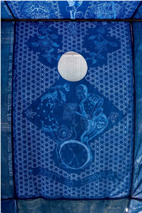
'Sleeping, Rotting, Resting, Weeping', 2021, hand-printed (katazome) and hand-drawn (tsut-sugaki) indigo panels, steel bar, dyed rugs, glazed ceramics, epoxy resin, feathers, block-printed and digitally printed fabric (masks), bells, tassels, and miscellaneous small objects, dimensions variable. Photo by Ian Byers-Gamber. Courtesy of the artist, the Walker Art Center, the Carpenter Center for Visual Arts (CCVA), and François Ghebaly Gallery.

wanted to make a life-size bedroom out of porcelain based on James Baldwin's description in Giovanni's Room and the description of the ship cabin Jeanne Baret sailed around the world in. I thought with the misting system I hung above the sculpture, and a pump that kept things humid with distilled piss, herbal tea, and water from the Seine, that the sculpture would stay in a pliable wet porcelain state. The caretaking aspect was intentional in the work, but I didn't foresee all the "problems"—the way the porcelain cracked, dried out, turned yellow and stained from the tea and grew mushrooms. I realized only later that the work was enacting, in a physical way, a refutation of the eighteenth-century Europeans' fantasy that prized porcelain using the terms of white supremacy—its hardness, superiority, whiteness, and purity. The material itself refused this by turning yellow, by cracking, by being "contaminated" with other life—moss, mushrooms, bacteria.