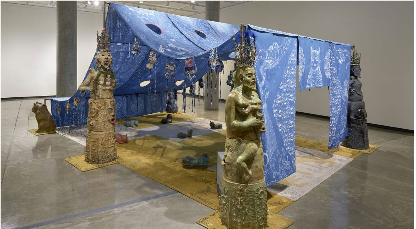
Seeping, Rotting, Resting, Weeping, 2021.

The artist's exhibition at Carpenter Center for the Visual Arts, Cambridge, MA, explores pandemic isolation, anti-Asian violence, toxicity and virality